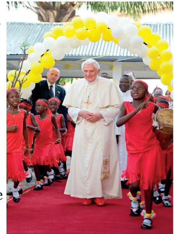
Pope Benedict XVI in Benin, Nov 2011 .

The Pope notes that Western societies would benefit from Africa's vision of life; it is creation-centered and includes ancestors, the living and those yet to be born, thus embracing all of God's creation (#69). Strikingly, the Pope points out that the defense of life entails the elimination of ignorance through literacy and quality education of the whole person, adding that illiteracy is a princi-