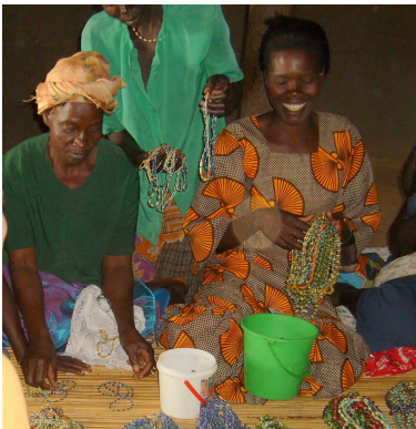
Ugandan women, 2009 AFJN trip