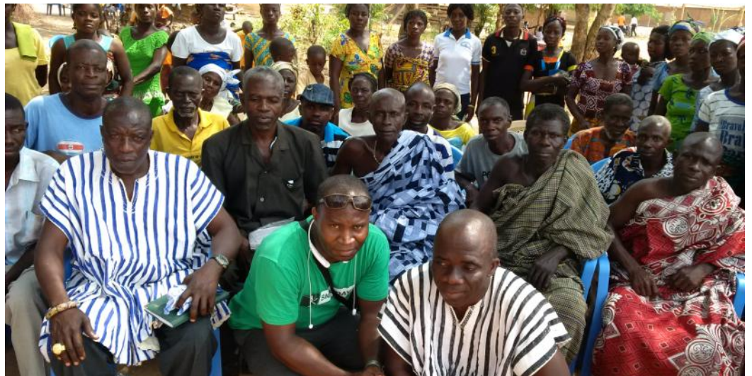
Town Hall meeting in Kunda /Krachi East Distric Volta Region

The Africa Faith & Justice Network (AFJN) team just concluded an unprecedented land grab prevention and awareness campaign in several villages and one very large high school in Ghana's Volta region. During this time, we reached millions of people through radio shows on three local FM stations. The panel discussion for the shows was in a combination of four languages: Ewe, Ntrubo, Akan (Twi) and English. The shows were held in collaboration with the Ecumenical Association for Sustainable Agriculture and Rural Development (ECASARD). The relevance of our message is rooted in facts, stories of victims of land grabbing and our competent team of three traditional chiefs, one policy analyst and three passionate land activists. In Ghana people urged us to make our campaign national.