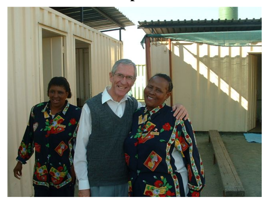
home-care workers with whom he ministers.

and development organizations throughout Africa.