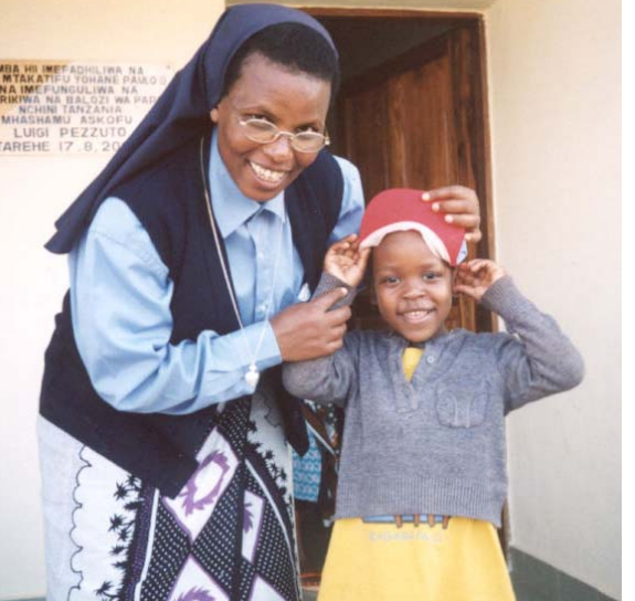
The Village of Hope in Dodoma, Tanzania provides AIDS orphans a sense of home and the love of parents.

the mission by helping to place AIDS orphans in the homes of families who cared for them and provided family life for them. Finally in 2002 they realized their dream of The Village of Hope. The children live in family homes [12 are finished with two more to be built] with "adopted" Tanzanian parent-educators. In each "family" there are 9 children of different ages. When all the cottages have been built, the Village will be able to care for 120-130 AIDS orphans at any one time. The arrangement gives the children a sense of home and the love of par-