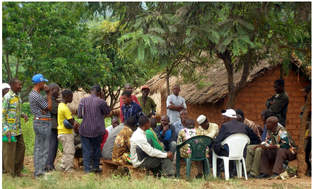
Miners of Mukera consult amongst themselves.

(C) tax, extort, or control trading facilities, in whole or in part, including the point of export from the Democratic Republic of the Congo or an adjoining country.”