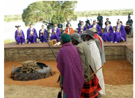
Blessing of water and fire

The conference included the blessing of water and fire at Lakipia Nature Conservancy, the first of its kind on the African continent. The ceremony combined traditional Saisho Homa Ritual performed by the Shinnyo En Buddhist Order and local rituals, songs and dance from the surrounding community elders, youth, men, and women. This ceremony aimed to purify, heal, and awaken people to their innate compassionate nature towards all life, and to ignite the light of hope and courage. Their goal was to burn away delusion and ignorance, smooth suffering and inspire altruistic action.