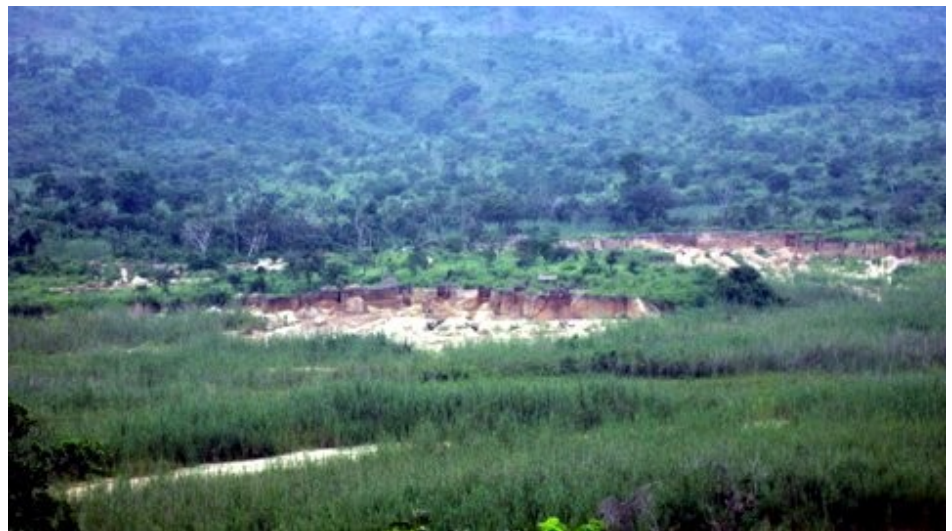
View of the gold mine from Mukera. It is only accessible by foot.

“Artisinal miner” conjures up throw-back images of miners from the California gold rush, rugged entrepreneurs who find nuggets of gold every week. However, these men and their families are in debt, and hungry.