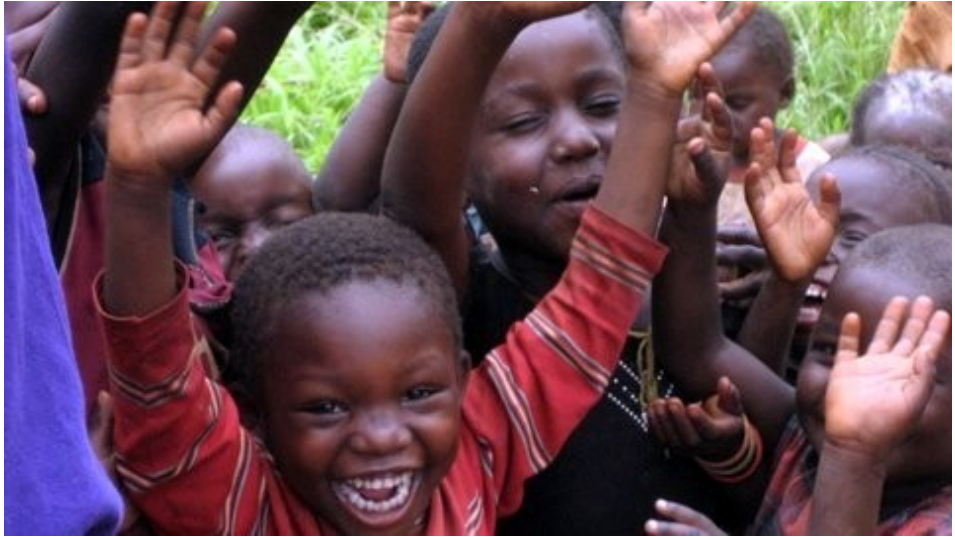
Can you believe these smiles? Children of Mukera

Mukera, which is meant to improve and defend the rights of artisanal miners and fund member's projects like the purchase of better tools, has no funds. It is their goal to make their own mineral dealership which will allow them to bargain for better prices. Most of all, they ask that their traditional laws regarding land rights be respected as multinational corporations are brought in to develop industrial mining operations.