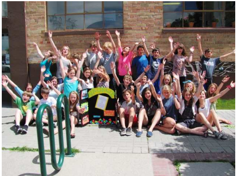
Students at the Foothill school showing support for Nkokwe

“Our sister school, Nkokwe Primary School, is located in the North Kivu region of the Democratic Republic of the Congo. We want to do everything we can to help the students and their families there to have a safe environment in which to live and learn. We feel very strongly about the problems in the DRC and we believe Section 1502 in the Dodd-Frank Act will help prevent future violence in the region. Waiting to act on these rules is only prolonging the suffering of Congolese people. As consumers we, along with many others, are very willing to pay more for electronics and jewelry that have not been funded by rape, maiming, or murder. Please support Section 1502 and help bring prosperity and peace to the Congolese people. Thank you! ”