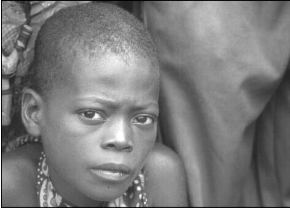
Rape has become a pandemic in Eastern DRC's war.

The offenders are the Congolese army, internal militia groups (which, as of today are about 47 in the north and south Kivu provinces) and foreign rebel groups operating on Congolese territory. For the residents of Rugari, Rumangabo Ntamugenga, and the surrounding areas it is not the first time women have had to face the Congolese army on rape issues. In 1985, the former president Mobutu Sesse-Seko sent many soldiers to the Rumangabo military base