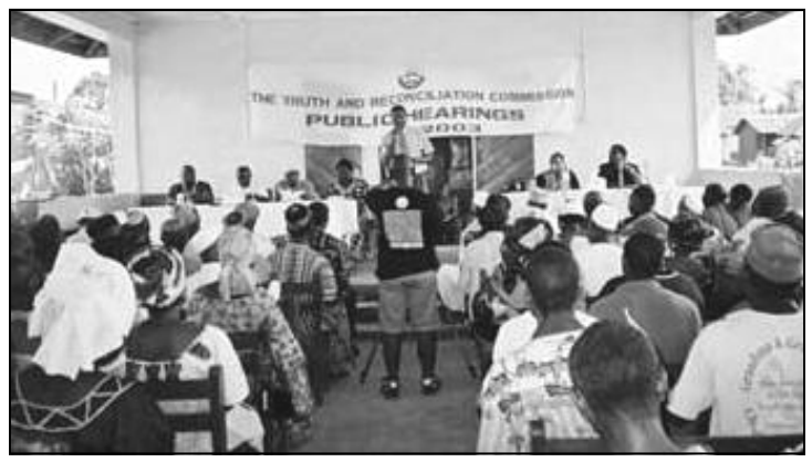
Public Hearings of the TRC.