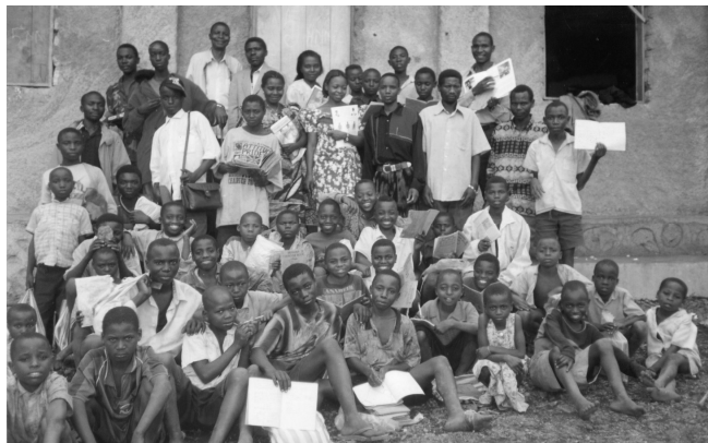
One local community at Nkokwe at the end of an HIV/AIDS awareness workshop