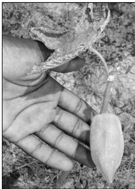
Leave farming in the hands of Africans

The continuation of farm subsidies will greatly disadvantage African farmers, trapping them in subsistence agriculture without any safety net or choice of career. A recent Oxfam report claims that a repeal of the already illegal U.S. cotton subsidies would result in 1 million fewer West African children going to bed hungry and 2 million more receiving an education. The countless documentations of the injurious impact of