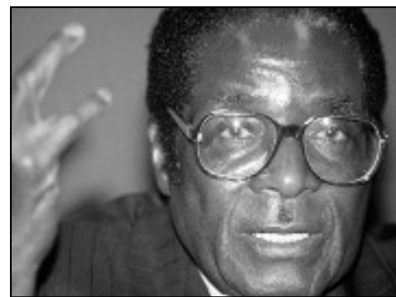
President Robert Mugabe

Mugabe's ability to maintain the presidency confuses many outsiders. Despite his lack of action to improve economic conditions and his unfair social "renewal," there has not been a unanimous call for his removal by those in Africa. Why is it that even in this sub-Saharan dream country full of intelligent citizens, doctors, lawyers, and academia, a strong civil society cannot seem to do enough to turn the country around?