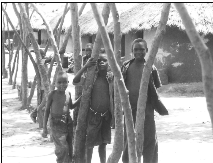
Northern Ugandan children still caught between war and peace