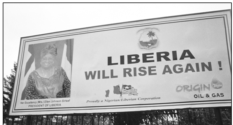
Billboard in downtown Monrovia.

The woeful condition of the roads makes travel difficult both in the city and in areas leading to neighboring villages. Traffic congestion has become horrendous. Many more private automobiles, taxis, motorcycles, and motor bikes crowd the roads and slow the pace of traffic. Vehicles share the road with pedestrians who weave in and out of the moving traffic, some of them with carts full of building materials and other supplies. Just in the past