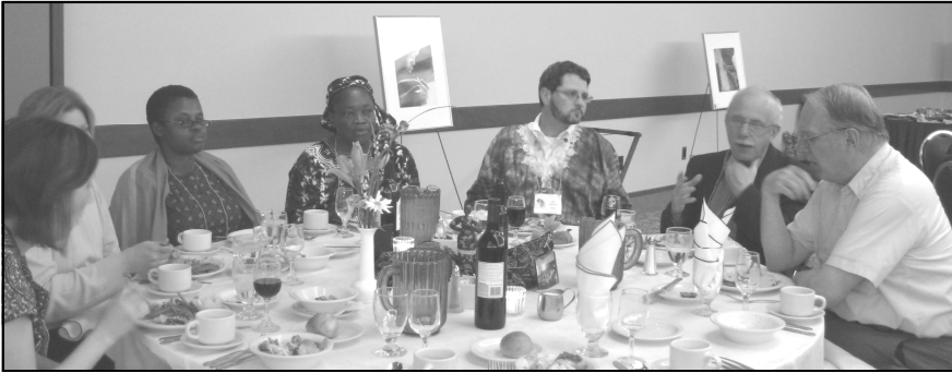
Conference Participants at the Banquet Celebration on April 19th, 2008.

Also, on a related note, our colleagues at Network and the Catholic Alliance for the Common Good are hosting the Convention for the Common Good in Philadelphia July 11-13. It is an attempt to gather concerned citizens together to contribute to platform proposals that can be forwarded to the candidates for president that will reflect the Common Good. Go to www.commongoodconvention.org for more information and registration.