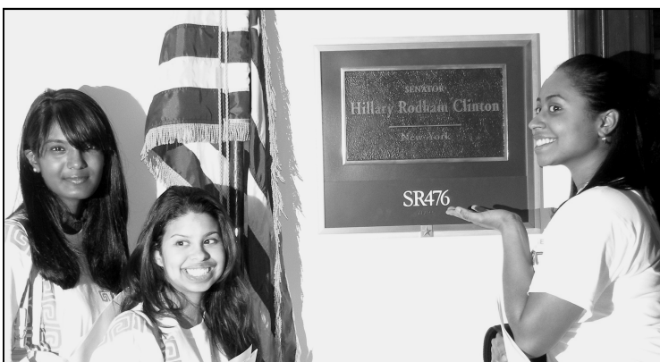
St. Catharine’s Academy students at Senator Hillary Clinton’s office on Capitol Hill.

Upon their return, as part of their campaign for peace in the Congo, students at St. Catharine Academy wrote letters to the US Ambassador to the Congo urging him to take these issues to heart. One of these students, a freshman, was honored by her church community for her work and commitment to the campaign for peace and for the health of rape victims in DRC. Now, this Church is expected to join the campaign for peace in Congo.