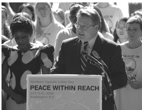
AFJN convened the Northern Uganda Lobby Day, which brought over 700 activists to Washington. Left: Congressman Chris Smith addresses the press conference. Right: Participants before lobbying.

There have been several significant developments, both domestically and internationally, related to northern Uganda in the past few months. As peace talks between the Government of Uganda and the Lord's Resistance Army (LRA) continue to take place in Juba, Southern Sudan, partners and constituents of AFJN have successfully generated significant momentum in their advocacy for a peaceful resolution to the 20 year conflict. In response to intense international lobbying and organized public demonstration, the Juba talks are beginning to gain support internationally.