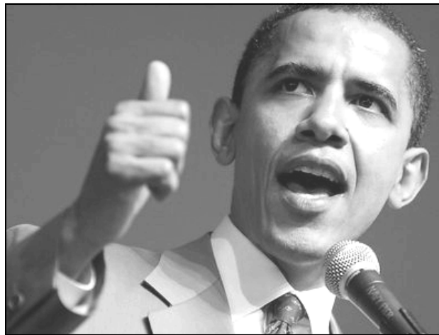
President-Elect Barack Obama may fall short of the change he promised, unless we hold him to it.

Obama must be reminded throughout his presidency that a global system that delivers profits to some and robs others of their prosperity will not create the change he seeks. It is our job to ensure that when he says he wants to 'strengthen the African Growth and Opportunity Act (AGOA), that it does not mean he will put more money in the coffers of the oil companies who have benefited from President Clinton's unsuccessful attempt at African development.