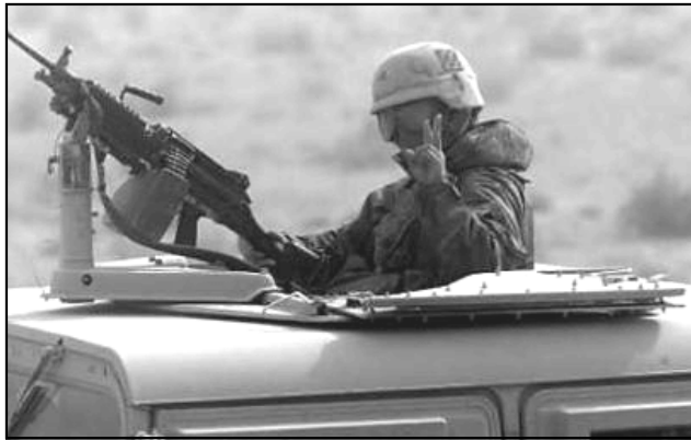
Instead of promoting development and diplomacy as paths to security in Africa, the United States has chosen to use the military and private defense.

AFJN. Every child is a gift from God and every child deserves a chance to live. Currently, AFJN is part of a working group that is drafting specific proposals to present to Congress regarding the reauthorization of the President's Emergency Plan For AIDS Relief. Continue to check our website for ways you can aid in this endeavor. Join us as we advocate for providing better pediatric diagnostic tools and more treatment for children with HIV/AIDS, thus providing hope for the futures of millions of children worldwide.