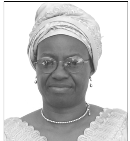
Christiana Thorpe, Minister of Education

What has not been acknowledged, and something that AFJN wishes to raise, is the role that Ms. Christiana Thorpe played in the election. Christiana is a Sierra Leonean woman from Freetown, a Catholic, a teacher, in her earlier years a member of the Sisters of St. Joseph of Cluny and headmistress of one of the premier schools in Makeni. I was the chair of the Board of Governors for that school, and at the time I was Education Secretary for the Diocese of Makeni. Christiana was a good friend of mine. I always admired her passion for students, teachers, and staff, her fairness and firmness in running the school as well as her cheerful nature. She later served in the Ministry of Education and in mid-90 became the Minister of Education for the AFRC Government.