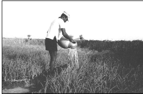
AGRA will undermine traditional African cultivation practices with high-tech farming.

finances a few crops at the expense of others, like in the US where 75% of food is derived from 12 plants. Rise in cost among small scale farmers will result in small farmers losing their land thereby increasing inequality. Also, since inputs are to be supplied by multinational corporations, there is danger that agriculture in Africa will be controlled by foreign powers. Foreign bodies will eventually dictate the technology to be used, the land use practices, and financial modalities by institutions and governments that accept AGRA financing.