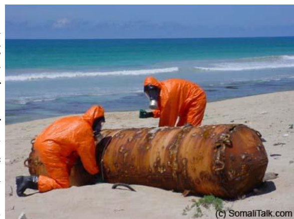
The 2004 Tsunami brought to Somali shores this Toxic waste containers

We continue to advocate for tougher regulations in the US and other industrialized nations to address the issue of gas flaring and toxic chemical use in oil and other natural resource extraction in Africa, electronic and toxic waste such as nuclear dumping in Africa. These practices are causing many deaths, cancers and respiratory illnesses, poisoning drinking water sources, arable land, sea water and aquatic life. Many communities in the industrialized world do not want toxic waste stored close to them, but unfortunately parts of the African continent have become a cheap and easy dumping ground. While African governments are still indifferent to these critical problems, the governments of industrialized nations have the moral obligation to enact legislation along the line of sections 1502 and 1504 of US public law (PL 111–203) known as Dodd-Frank law to forbid toxic and electronic waste dumping and require safe natural resources mining in order to protect Africa and our shared environment.