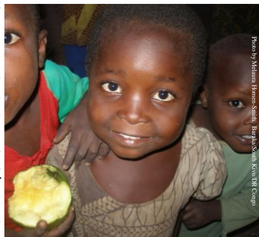
Banka/South Kivu/DRC Congo

AFJN has been advocating for policies that fund projects to enhance global health, namely access to clean water and the fight against malaria, HIV-AIDS and tuberculosis. The President's Emergency Plan for AIDS Relief (PEPFAR) initiated by George W. Bush has been a successful project in some parts of Africa such as Uganda and South Africa. Similarly, the campaign to prevent and treat malaria and tuberculosis has made progress in places where it is implemented in Africa. For example, it was estimated that about 2 million children under the age of five died from malaria every year, but in the last decade this has been cut in half. This also means that children are spending more time in the classroom and less in the hospital, and families are saving money on medical bills. Congressional funding for these programs has been bi-partisan since 2001 and we hope that it will continue.