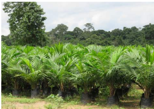
Oil palm seedlings which are made available to local farmers free of charge.