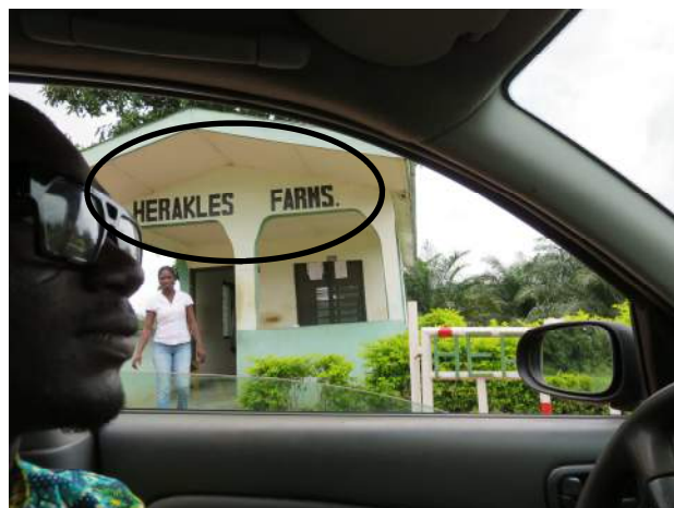
There were occasional signs of the previous owner around the palm plantation.