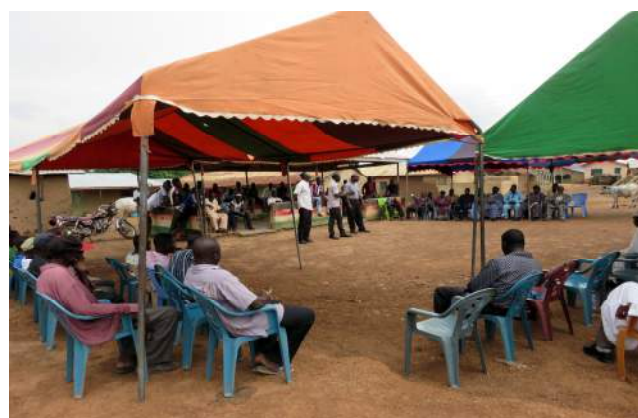
AFJN conducts an FPIC outreach meeting in Kpassa in Nanumba South District

The scholarship project that VR has begun consists of sponsoring four girls each year to attend school in the capital, Accra, through high school and with assistance to find post-secondary education. VR would also likely offer their scholarship graduates jobs. In August we were told that VR had $20,000 in the scholarship fund, and as of October their website says they have $25,000, though this is simply a jumping-off figure. To avoid nepotism, the VR team assists in selecting the candidates instead of leaving the task to any community committee.