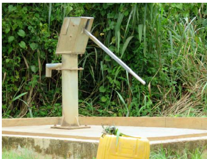
One of the boreholes (wells) dug by HF.

People were equally unhappy with the promised social programs. Only five wells were dug, and two desktop computers. There was no scholarship program started or clinic built. In a petition to HF in 2010 landowners cited these grievances and threatened desperately to get the government involved. Several times landowners told us that HF documentation stated that any grievances had to be settled in-person, in Paris. However, AFJN has not yet seen the lease to verify this. Even if it was simply a threat, not fact, it worked for a long time.