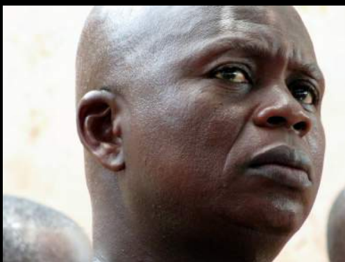
Paramount Chief of Trubo Traditional Territory, Nana Tedibo Kowura Odamba II