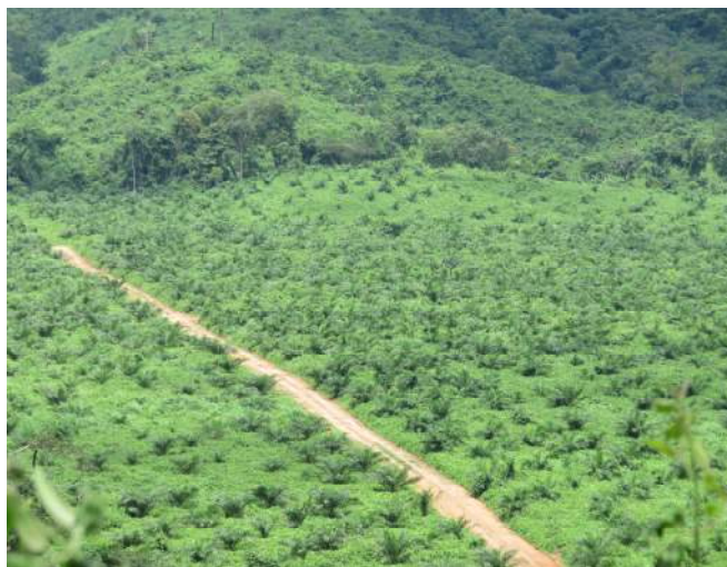
A view down into the hills of the VR plantation

The family heads were invited to the Gateway Hotel in Nkwanta, in the district of Nkwanta South, where they were shown the lease agreement for the first time and were asked to sign it. After assurance of an upfront signing bonus of $24,000 to be divided among landowners, they signed. The lease agreement was for 50 years, renewable for 25 years. The yearly lease payment was $5/ha (ha=hectare); $5 is said to be the legal minimum land lease in Ghana, but this has not been independently verified. In addition, like in all land grab deals, they were promised jobs for community members, scholarships for their children, a school library, computers, water wells and a clinic.