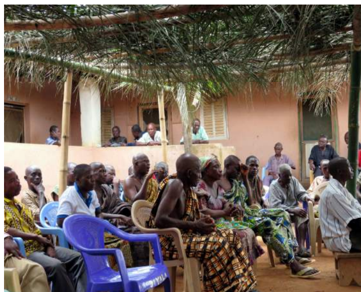
The chiefs at the Brewaniase community meeting.

Before AFJN held this meeting most people were unaware of the global land grab phenomenon, but they were enlightened after we connected that with what had happened with the land in their community.