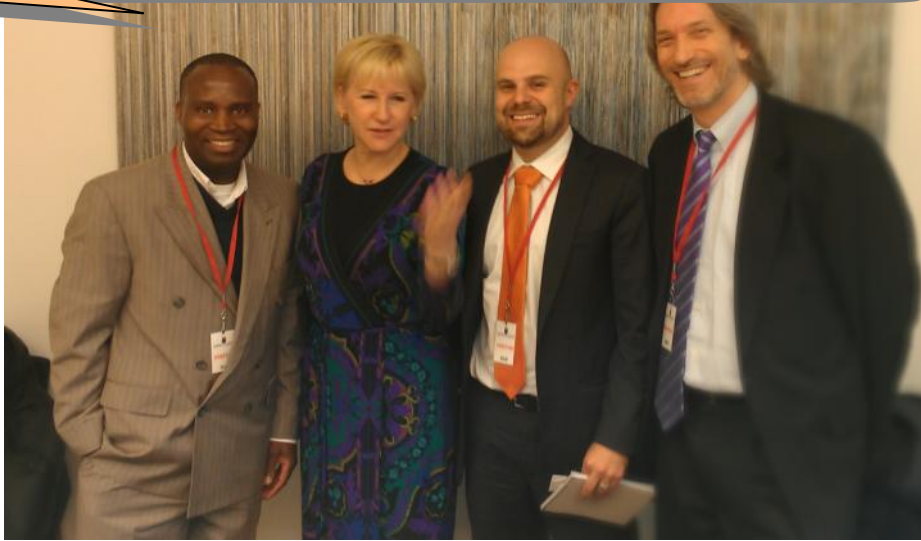
Jacques Bahati, Swedish Foreign Minister Margot Wallstrom, Sasha Lezhnev, John Prendergast

After the Feb 6, 2015 briefing organized by the office of Senator Dick Durbin with contributions from AFJN, the work to protect this law from being repealed or watered down is ongoing. We had a meeting with the Swedish Foreign Minister at their Embassy in Washington, DC, to advocate for strong support of European Union's conflict mineral law.