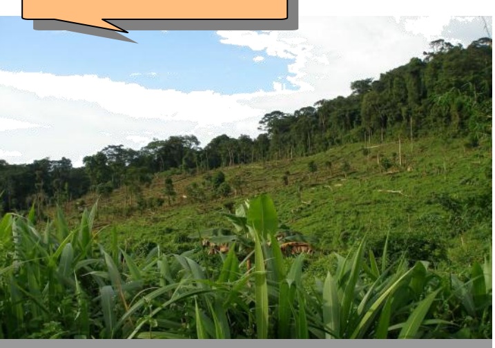
Land Grab in Mundemba South West Cameroun

More than 50 % of total land grabbing worldwide occurs in Africa. As of June 2012 about 227 million of Hectares (876,000 square miles) of land – the equivalent land area of California, Oregon, Washington, and the eastern US States stretching from Maine to Florida, plus Wisconsin, Illinois, West Virginia and the District of Columbia – has been grabbed from developing countries through shady deals that dispossess the people of their land, their livelihood and their identity and drive them further into poverty.