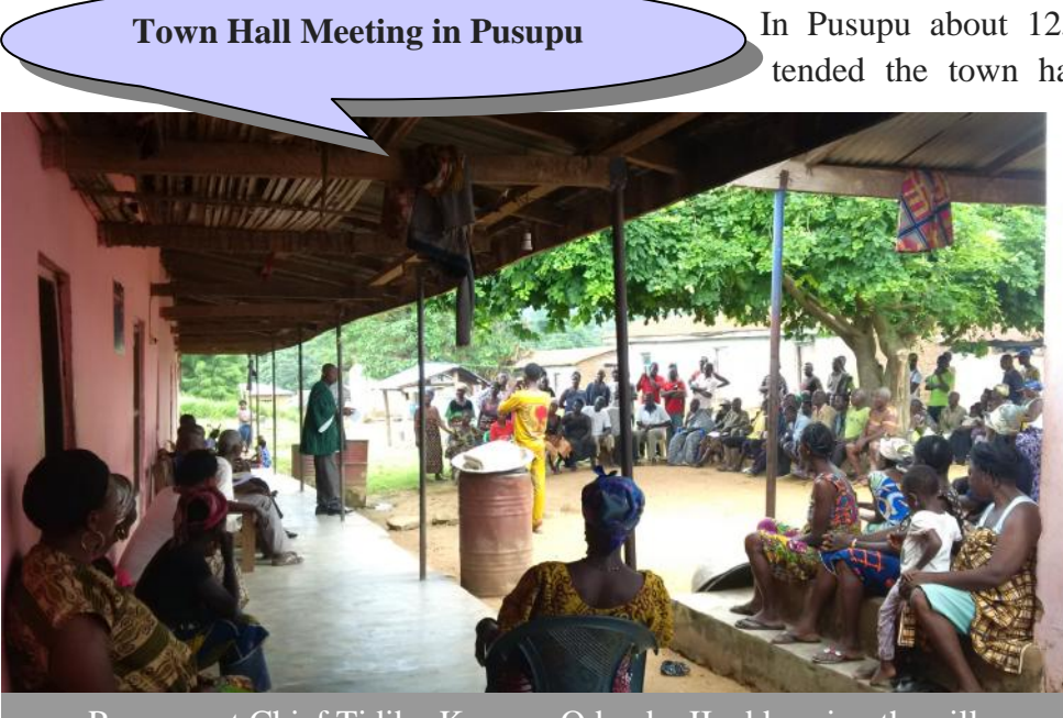
their children. The community made a strong commitment not to lease their land to anyone, unless it will benefit them. A Malaysian company is still trying to get the community to lease their land at a great disadvantage to the community. In 2000 Pusupu had inhabitants. 4547

mother from Dorfor traditional area, reported to AFJN that her clan and three others withdrew their names from a memorandum of understanding in an ongoing land acquisition by foreign corporations in the area. They have agreed to hold out until they are clear that the land deal will benefit them now and for generations to come. We celebrate this victory with all the members of the four clans, an estimated total number of 28,000 people.